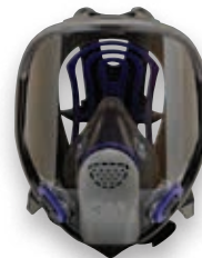
Ultimate FX FF-400